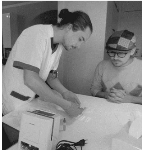
Figure 3: Enacted scenario (simulation).

evaluated through a focus group with four telemedicine physicians and an interview with the managing director of the ambulatory care organization. The simulation (i.e., a video recording of it) was evaluated in a workshop with two physicians of the telemedicine organization and the managing director of the ambulatory care organization. Both the textual scenario and the simulation were evaluated on the desirability of the future processes represented by them as well as the requirements for realizing these future processes.