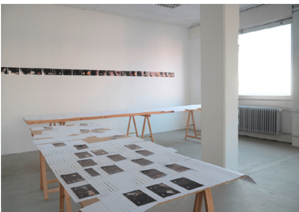
continent . Extending the Dialogue on the Technosphere. Video as Publication, Studio Nina Jäger, Saarbrücken

of culture(s). From the nascence of information theory (1948), approaches to language have become increasingly analysed, tokenized, fragmented, resampled, cut-up, and (mis) interpreted. Words are irreversibly erased and omitted, predicted and interpolated—as is done when transcribing the spoken voice to the typed page. In trying to capture the essence of a conversation do we not sometimes miss what has been said, let alone what must remain unsaid? What role is played by the pauses in the ceaseless transmissions that mark our contemporary situation? Can we listen to these anew? And what relationships hold in the process of lo(o)sing words, as a poietic strategy of interposition?