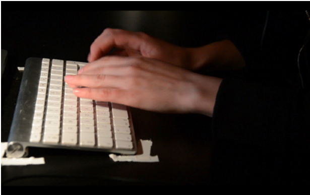
continent . Extending the Dialogue on the Technosphere. Production Residency, Vorbrenner.org, Innsbruck, April 2017