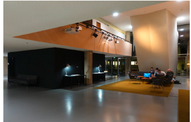
continent. videobox, document studio and production corner. 1948 Unbound, HKW Berlin

We meditate here on the technology of language and the use of language technologies, in the production, mediation and publication