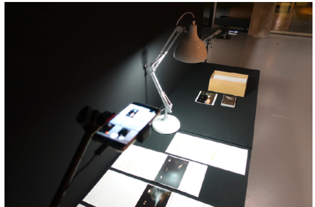
continent. document studio. 1948 Unbound, HKW Berlin