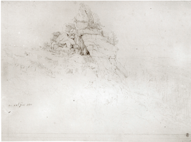
Fig. 4: Caspar David Friedrich, Der Trudenstein im Harz , 28. June 1811, pencil on paper, 25.6 x 35.0 cm, Location unknown.

The fact that Friedrich made this decision consciously is suggested by a drawing made on June 28, 1811, during a hike in the Harz Mountains, which Friedrich used as a model for the striking rock pyramid (Fig. 4).