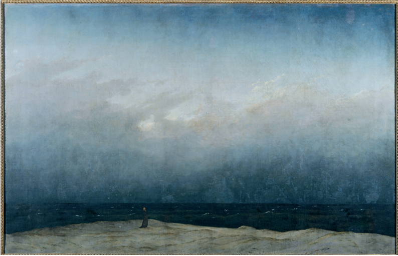
4. Caspar David Friedrich, The Monk by the Sea , 1808/10, oil on canvas, 110 x 171.5 cm, Berlin, Staatliche Museen zu Berlin, Alte Nationalgalerie.

landscape in order to experience a sense of longing is thwarted and the painting itself emerges in its concreteness: “[...] that which I should have found within the picture I found instead between the picture and myself, namely a claim that my heart made on the picture, and a rejection that the picture did to me [...].” 15 Indeed, Friedrich’s painting causes the two-dimensional image carrier to become particularly conspicuous, especially since its boundaries alone define the field of the visible. By dispensing with all the usual principles of landscape composition, the artist reduced the seascape to three pictorial elements, the beach, the sea, and a large section of sky, which can also emerge at any time as two-dimensional stripes. The line of the horizon, which runs straight and without any curvature in an uninterrupted manner, reveals itself as a parallel to the upper and lower edges of the picture and thus incorporates characteristics of the picture carrier into the representation. It has been noted repeatedly, with good reason, that the eye is also drawn to the painting as a two-dimensional and limited artefact. Simultaneously, however, the suggestive perception of space is not permanently suppressed. The juxtaposition of the colored surfaces with which the beach, sea and sky