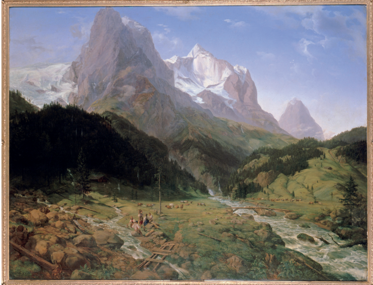
1. Ernst Ferdinand Oehme, The Wetterhorn, 1829, oil on canvas, 141.5 x 184.5 cm, Berlin, Staatliche Museen zu Berlin, Alte Nationalgalerie.