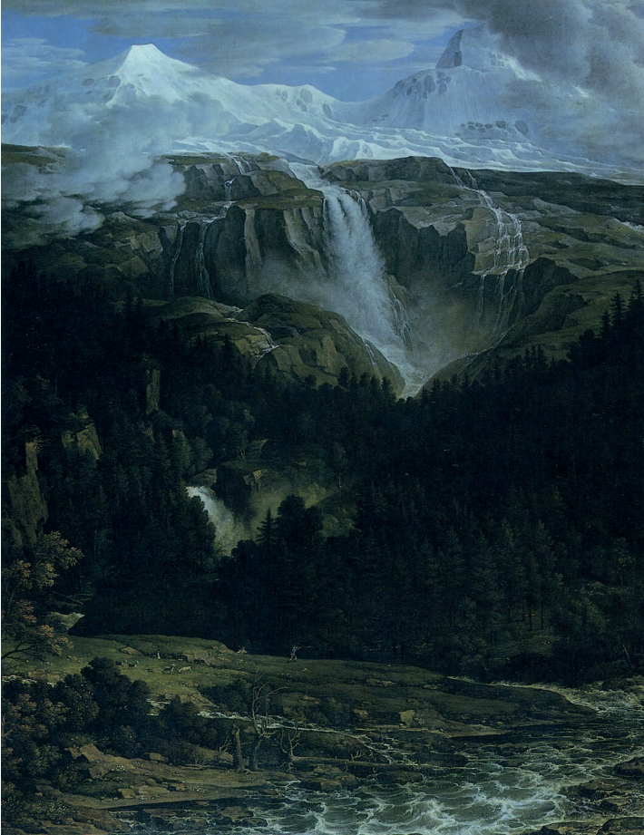
Fig. 1: Joseph Anton Koch, Der Schmadribachfall , 1811, Oil on Canvas, 123 x 93.5 cm, Leipzig, Museum der bildenden Künste.

Dagobert Frey was the first to note that Koch's composition employs multiple points of sight, which creates the impression that the picture consists of different spatial zones. 39 While the foreground is composed based on a point of sight that is approximately at the level of the figure of the hunter, a higher point of sight must be assumed for the upper part of the picture containing the glacier and