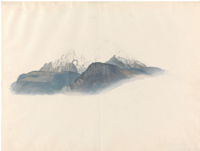
Fig. 5: August Heinrich, Vorgebirge des Watzmann , 1821, Aquarell, 32.5 x 41.3 cm, Oslo, Nasjonalmuseet.

are found more frequently in Friedrich's drawings. They serve as a measure and illustrate the size of a human being. 57 Thus, it must be assumed that Friedrich, who carefully documented proportions and distances in the drawing, deliberately refrained from doing so in the painting. Although the slopes, which are densely covered with deciduous trees interspersed with a few patches of green meadow, initially suggest a considerable distance from the sparse vegetation that thrives on the rock formation, it is impossible to estimate this distance reliably. This irritating impression is due to the fact that the rocky cliff-like ridge in the foreground inclines strongly inward into the pictorial space, whereas the rock formation in front of the snow-covered peak leans towards the beholder. As a result, the pictorial space in the middleground appears to be strongly compressed. If one compares the summit region in the painting by Friedrich, who had never seen the Watzmann with his own eyes, with a watercolor nature study produced by his student August Heinrich during a trip to Berchtesgaden, it becomes clear that Friedrich adopted the shape of the snow-covered summit region very precisely but clearly tilted the rock formation in front of it, which in Heinrich's painting is positioned nearly parallel to the picture plane, i.e., towards the beholder (Fig. 5).