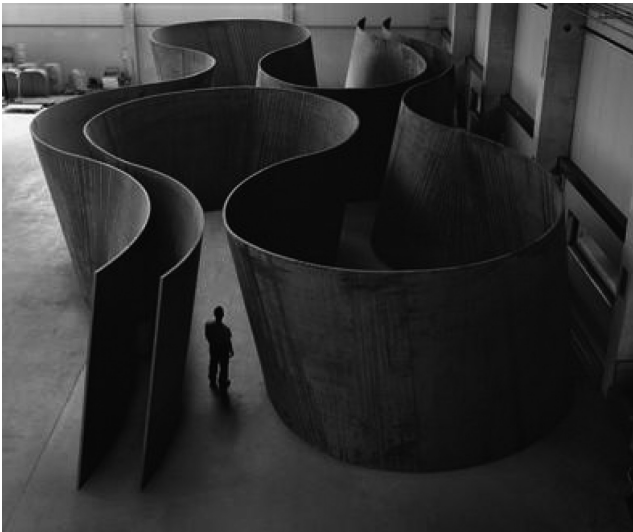
Inside Out , 2013-14