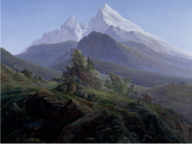
3. Caspar David Friedrich, The Watzmann , c. 1824/25, oil on canvas, 135 x 170 cm, Berlin, Staatliche Museen zu Berlin, Alte Nationalgalerie (on loan from DeKaBank).