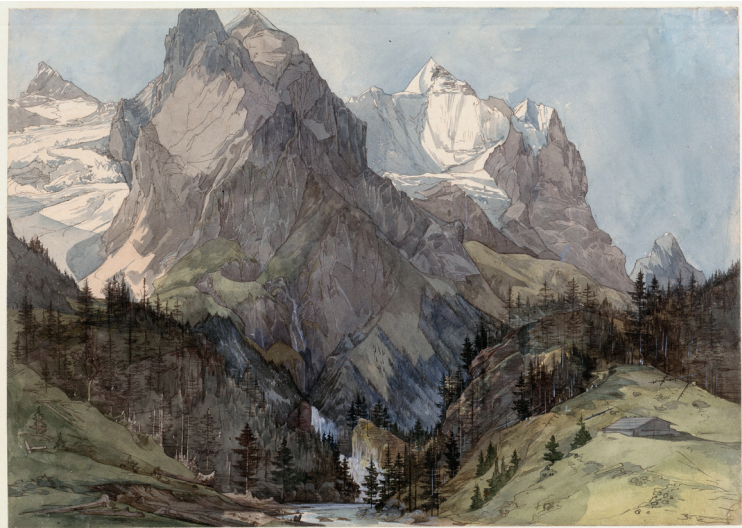
2. Ernst Ferdinand Oehme, The Wetterhorn with the Rosenlaur Glacier, probably 1825, pen and brush, 23.8 x 33.5 cm, Berlin, Staatliche Museen zu Berlin, Kupferstichkabinett.