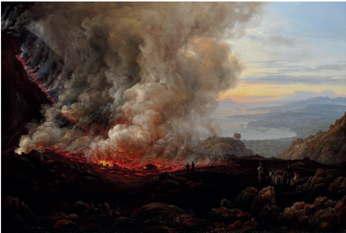
An Eruption of Vesuvius (1824)

There is one important advantage of this kind of second-order representation of the sublime over the first-order representation of the sublime in terms of the possibility of eliciting the Kantian sublime: the former gives more freedom to the viewer as the subject of aesthetic experience. As I noted in section 2 above, the real worry