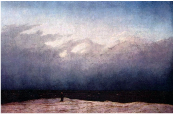
Monk by the Sea (1808-1810)

To be sure, these paintings can be said to represent first-order sublime themes. For, first, the viewer still sees the sublime natural landscape. Second, the viewer is directly shown the human-nature encounter. However, the setting is also configured to represent what might be called a second-order sublime: we, as viewers, are located behind a subject or multiple subjects, gazing at a scene that would elicit the sublime experience in us if we were in their place. So, we are invited to have a perceptual empathy or identification with the depicted subject(s), and to imaginatively reconstruct what they would be perceiving and how they would be responding to it.