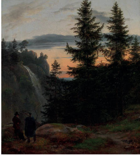
Two Men Before Waterfall at Sunset (1823)