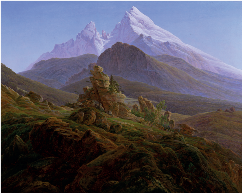
Fig. 2: Caspar David Friedrich, Der Watzmann , 1824/25, Oil on Canvas, 170 x 135 cm, Berlin, Alte Nationalgalerie.

In this text, von Quandt refers to Kant's aesthetics. Therefore, it is possible that Friedrich might have come into contact with Kant's theory of the sublime through von Quandt. Friedrich, who was also represented at the Dresden Academy exhibition by a high mountain landscape that was mentioned by von Quandt almost in passing, must have read the detailed acknowledgement of Richter as a painter of the sublime with great attentiveness. 53 Friedrich's Watzmann can thus be understood as a deliberate response to Richter's painting. 54