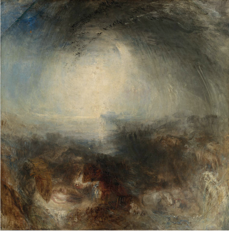
5. Joseph Mallord William Turner, Shade and Darkness. The Evening of the Deluge , 1843, oil on canvas, 78.7 x 78.1 cm, London, Tate Gallery.

Turner's painting of the eve of the Flood reveals, on prolonged viewing, that a lengthy procession of animals leads from the foreground across a diagonal in the right half of the picture to the ark, which can be seen in the middle of the picture in faint blue-grey colors on the horizon. Like an echo, a flock of birds in the sky corresponds to this procession, which seems, alongside the cloud formations and the animals, to form a vortex in the lower half of the picture. In front on the left, reclining, probably sleeping people are visible, who, according to an inscription in verse that Turner added to the picture, are ignoring the impending Flood.