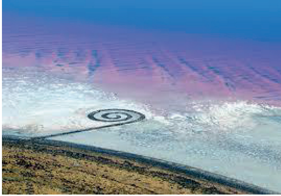
Spiral Jetty , 1970