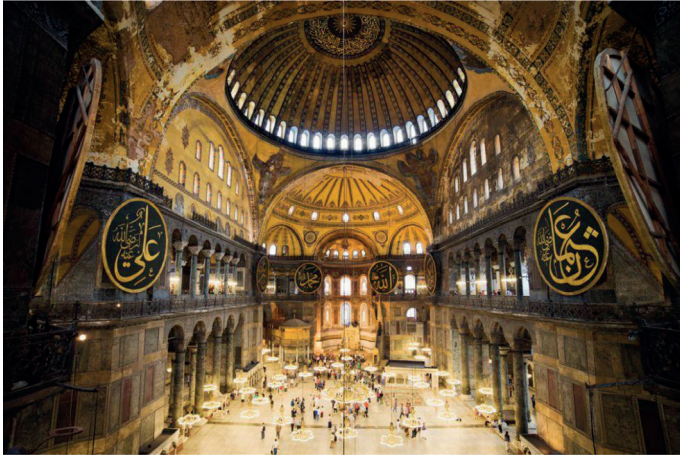
Hagia Sophia (537 AD)

ture (e.g., Hagia Sophia , Istanbul), sculpture (e.g., Richard Serra's Inside Out ), land or earth art (e.g., Robert Smithson's Spiral Jetty ). It would be particularly difficult to attain this effect in painting.