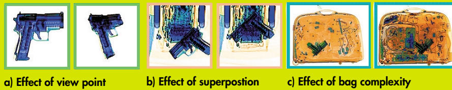
Fig. 3: Relevant factors of threat detection.