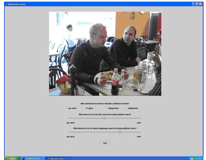
Figure 1: Screenshot of the first experiment: The first question allows the user to enter the preferred modality. The two slider controls allow the user to rate the criticality of the situation (for oneself and for the environment).

In the second experiment we show other participants a subset of the situations. For each situation we ask them to rate whether they would check the settings of an automatic system. After rating the situation a window pops up displaying the notification modality chosen by the automatic system. This modality is generated by taking the modality preferences from the first experiment and "changing" it slightly depending on the momentary simulated system confidence. In one experiment block the system confidence is displayed, in the other block no information about system confidence is given. In this way the effects of displaying